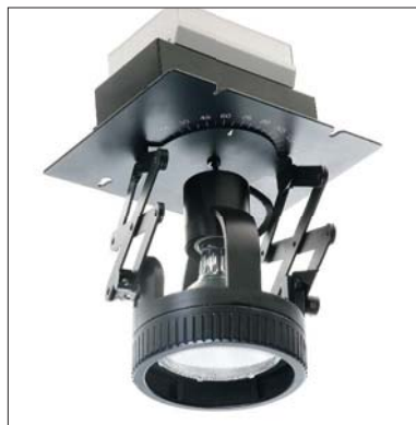
Module configurations range from 1x6 to 2x2 configurations.