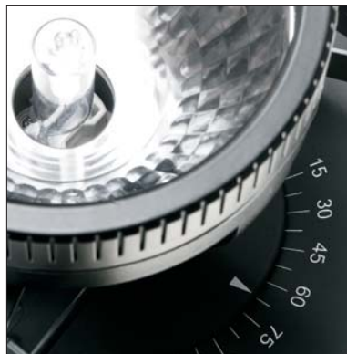
Modules are fully adjustable. Extend, tilt, rotate and lock into position.