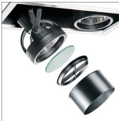
Select up to three accessories per lamp module. No additional holders or fasteners required.